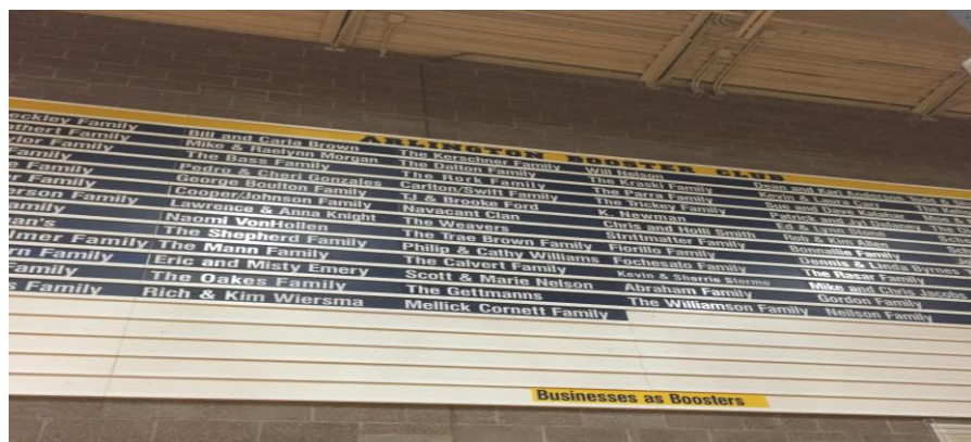
6"x36" yellow board with standard navy lettering. On West wall.